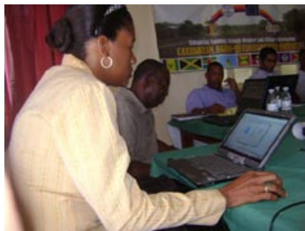
Statistical Climatology Training Workshop

Capacity building has begun, and must continue, in areas such as estimating evapotranspiration and irrigation requirements, pests and diseases modeling, crop growth and development simulation, climatic data analyses, and weather and seasonal climate forecasting and their applications to agriculture. Training must also continue for farmers in the interpretation of weather and climate information.