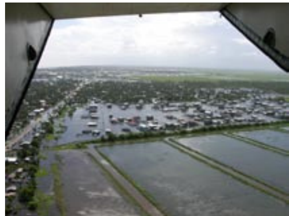
Flooded fields in Guyana in 2005

severe in decades causing crop and livestock losses, increases in food prices, reduction in export of some commodities like bananas, and increased pumping costs for irrigation. On the other hand, flooding also results in major and frequent losses: for example, in Guyana in 2005, flooding resulted in 59.5 % GDP in total losses with US $55 million from agriculture alone (ECLAC 2005), which was followed by another flood event the next year (ECLAC 2006). Hence, it is important to raise the awareness of the farming community in the Caribbean region to such weather- and climate-related impacts, and to products and services that could reduce their vulnerability and associated risks.