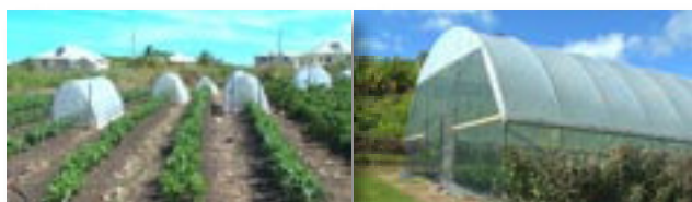
Row covers and greenhouses as adaptation options to climate variability and change

Another consideration for the future is to place greater emphasis on farmers' responses to or mitigation of potential yield-compromising weather and climate conditions. For example, what can a farmer do to reduce risks when a season of excessive rainfall is predicted? Besides irrigation requirements what preparatory steps can be taken when a drought or dry spell is predicted? Considering a future under a changed climate, what are some of the means of adaptation?