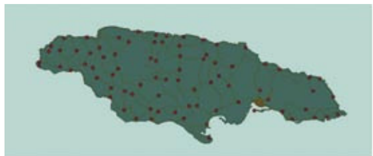
Jamaica weather forecast regions.