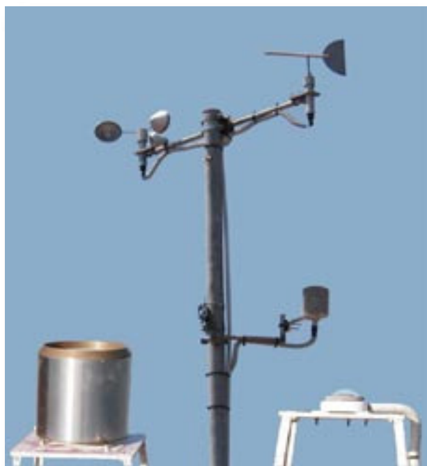
Automatic weather station

Efforts must be made by such entities to share their data so that the relevant applications for the benefit of the public can be made. There should also be national and regional centralised databases for agrometeorological data. The benefit of modern technology is such that data can be easily transmitted to central databases and readily converted for the relevant applications.